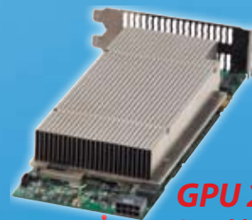
GPU 2 (Double-width)