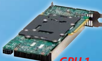
GPU 1 (Double-width)