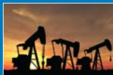
Oil & Gas Exploration